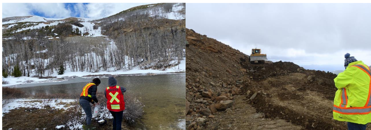
Figure 2. Water sampling (left) and cultural monitoring of road maintenance (right) at Elizabeth Gold Project

Monthly water sampling and ground disturbance monitoring is a regular part of our exploration program at the Elizabeth Gold Project (Figure 2) that is completed under the supervision of Xwisten Community members that have undergone certification training for environmental and cultural monitoring.