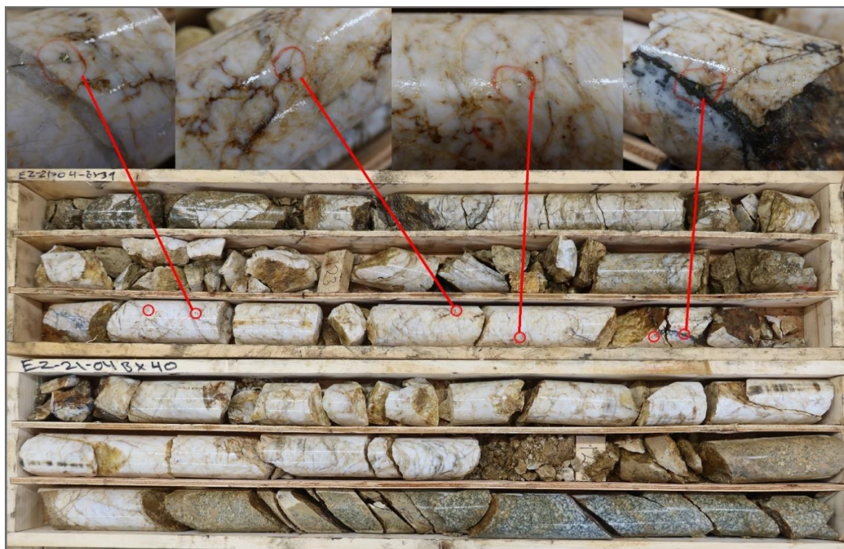
Figure 1. EZ-21-04. SW Vein with visible gold. Elizabeth Gold Project.

Current drilling is focused on the northern extension of the South West vein, approximately 150m along strike toward the northeast from the high-grade ore-shoot intercepted in hole EZ-20-06 which intersected 5.0m at 61.3g/t gold from 116.5m, including 1.5m at 186.0g/t gold from 118.0m (announcement dated Feb. 8 th , 2021).